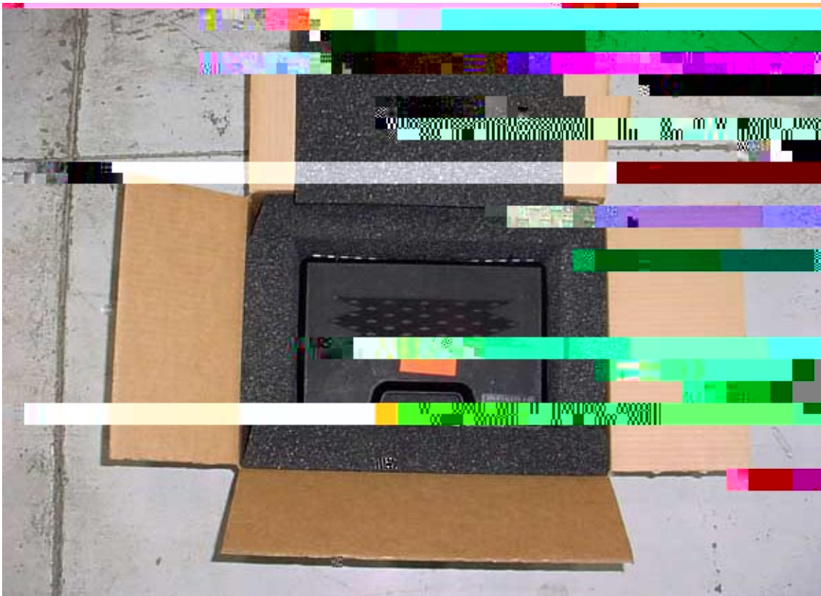
Figure 1. Delicate Product/Equipment – Fiberboard Box Overpack