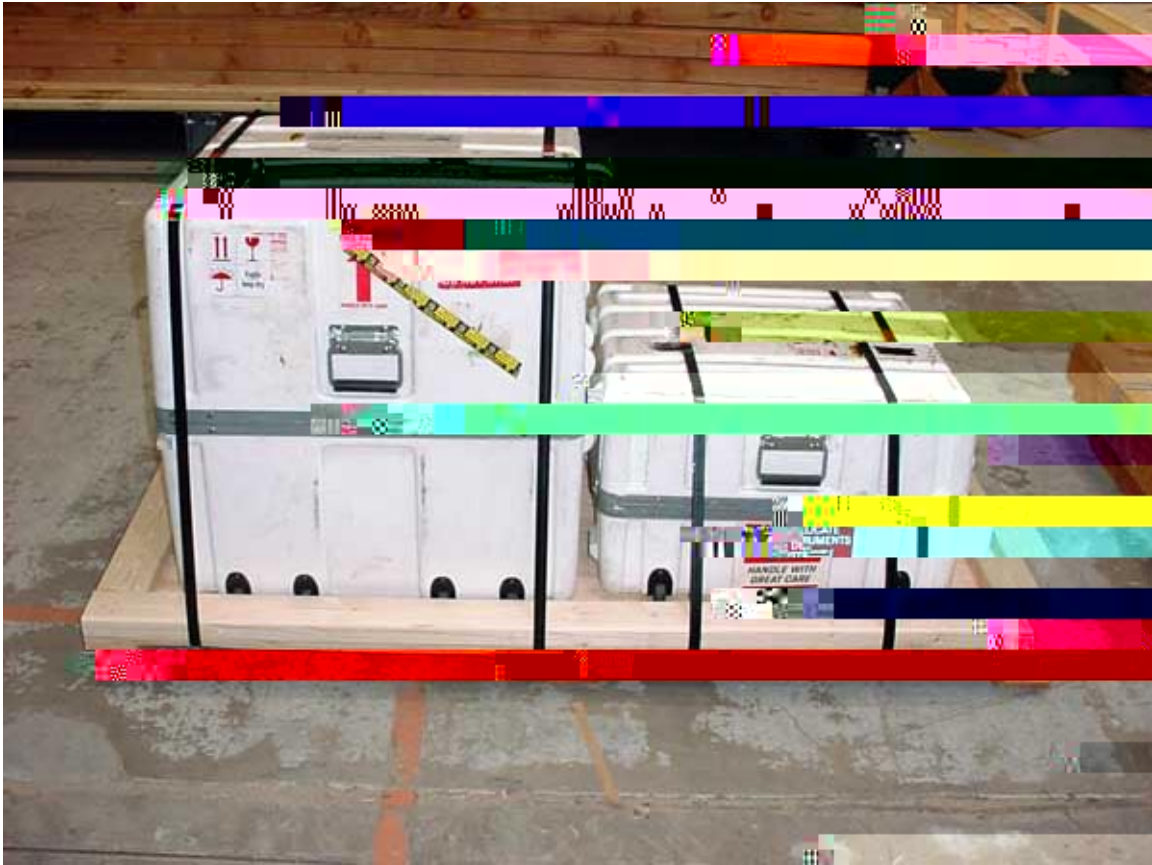
Figure 3. Sturdy Products/Equipment – Palletized Cases and Tool Containers